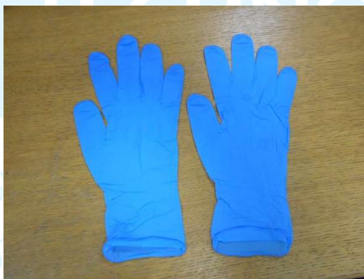
Nitrile Examination Powder Free gloves