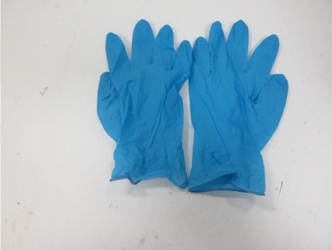
Nitrile examination powder free gloves described as RA/052/006/2018/C